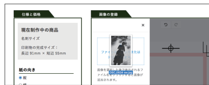
Placing an image...

Click on the "x" or on the image to open the edit window